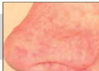
Fig. 2: 6 Weeks Post Treatment