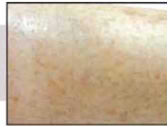
Fig. 3: 3-4 Months Post Treatment