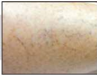
Fig. 1: Before Treatment