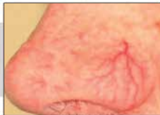
Fig. 1: Before Treatment