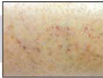
Fig. 2: 2-4 Weeks Post Treatment